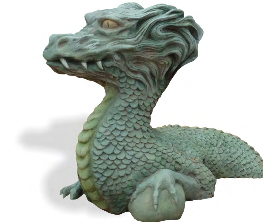
3 Great Falls Dragon_TC021