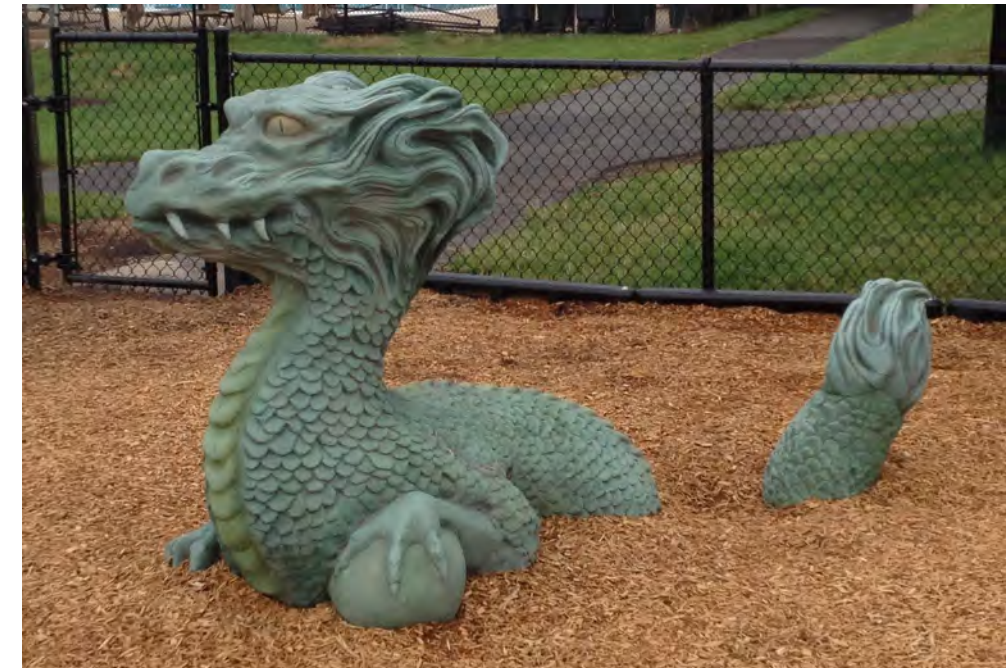
3 Great Falls Dragon_TC021