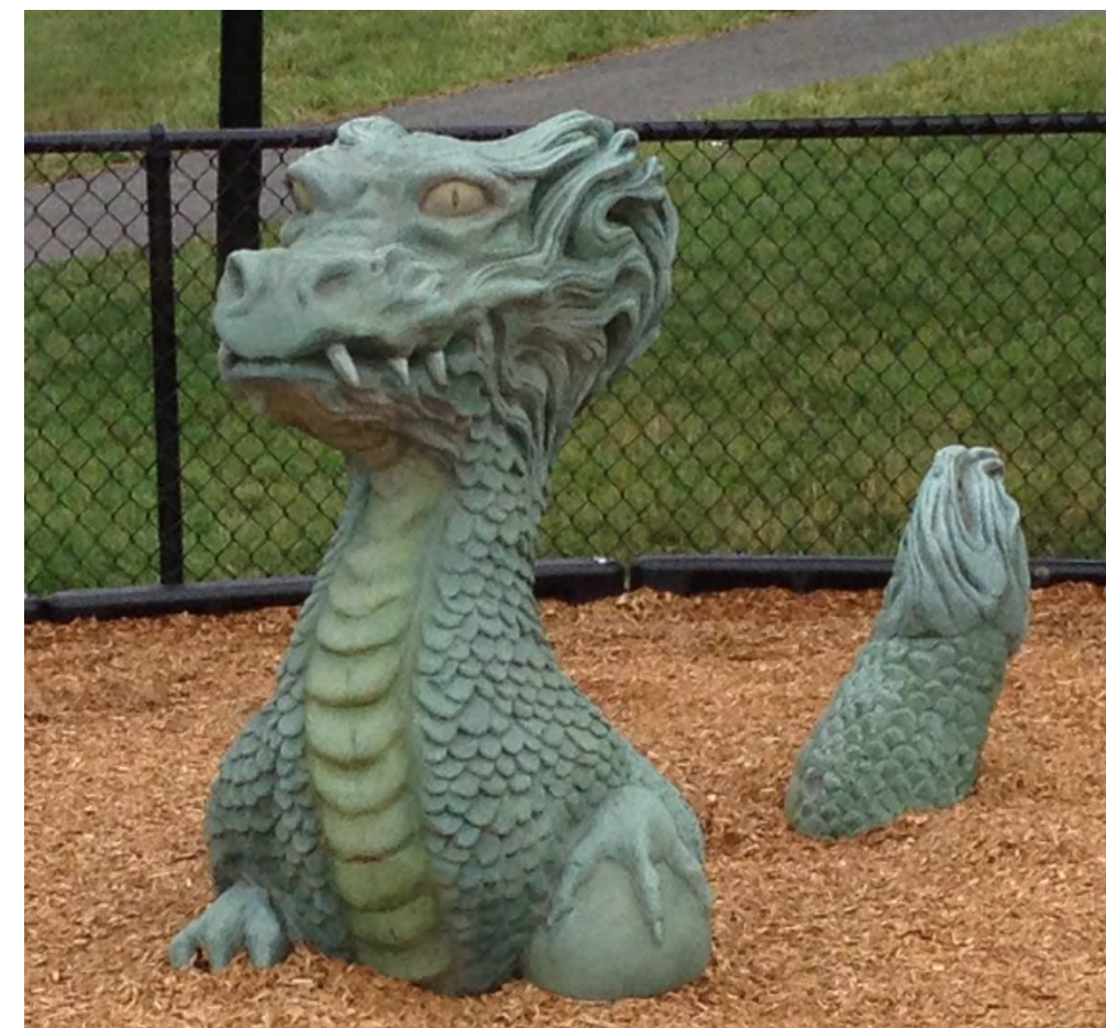
4 Great Falls Dragon_TC021